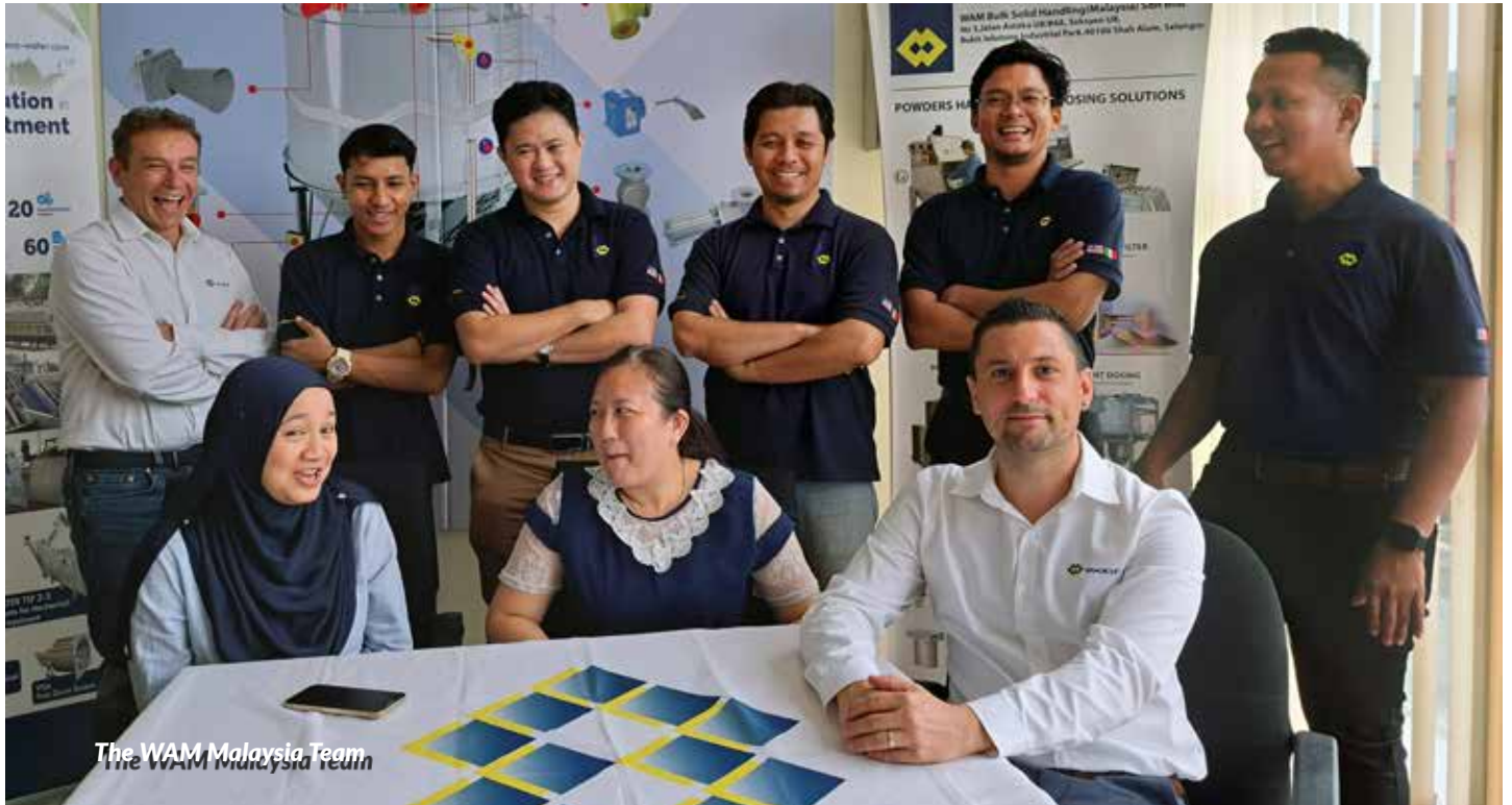
The WAM Malaysia Team

W AMGROUP®'s commitment to Southeast Asia dates back to the early 1980s, when a franchise agreement was signed in Singapore. It soon became clear that the Singapore location alone was not sufficient to cover the market, which spans several countries and time zones.